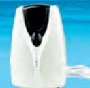
Phone-AC/HP Controller (Call to Control from Anywhere)