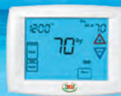
Wall Mount Thermostat